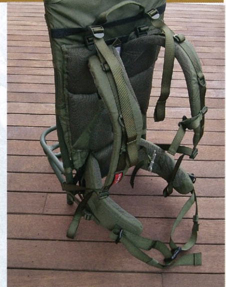
The strong and well padded harness is made by Tatonka, a specialist pack making company.

One negative is that the two back straps are too short to be used to wrap around a whole animal, so you'll need to